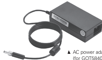
▲ AC power adapter (for GOT5840T-832-J)