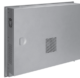
▲ Less screw design