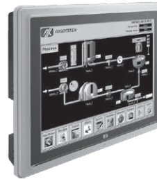
▲ Side view