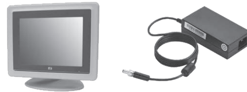
▲ Desktop stand