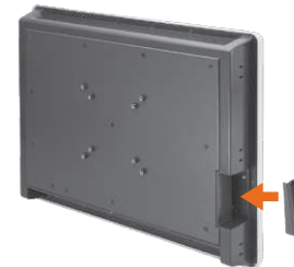
▲ CompactFlash™ slot with protective cover